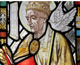
Wednesday, September 3rd St Gregory the Great, Pope and Doctor of the Church (540-604)

Lord, we pray for your loving support for the people listed below and their families as they deal with their illness. Guide the doctors who are seeking answers and making decisions about care/treatment. We pray that their illness is at a stage favorable for effective treatment. Enable their bodies to respond well to care treatment and their souls to experience comfort and peace in you. Make this an experience that draws them and their loved ones closer to you as well as to one another. We commit them to your mercy.