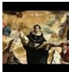
Tuesday, January 28th St Thomas Aquinas, Priest & Doctor of the Church (1225-1274)