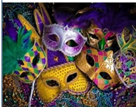
Tuesday, February, 13th is Mardi Gras

Question of the week? Who can I reach out to in order to help make my family/community/world whole? How can I go about doing so?